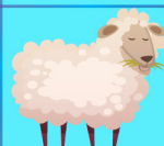
SHEEP AND GOATS